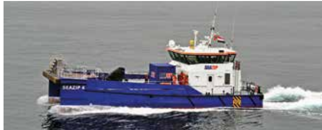
SeaZip 4 Length 26.30 m Passengers 12 Speed 25 kn