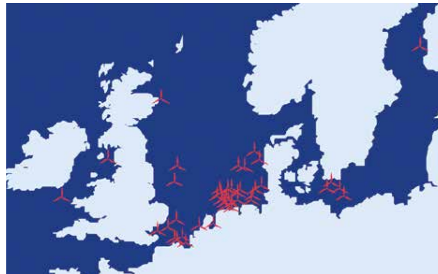
SeaZip Offshore is active on the North Sea, the Irish Sea and the Bothnian Gulf.

The second half of 2020 was a turbulent period for SeaZip Offshore Service, which was active with four crew transfer vessels and one survey vessel. To offer adequate capacity solutions within current projects, SeaZip regularly succeeded in deploying extra vessels from collegial partnerships. In 2020, SeaZip was involved in virtually all relevant offshore wind energy projects in the North Sea. Although in 2020 SeaZip Offshore Service provided O&M services to oil & gas platforms as well, the emphasis was and is on offshore wind energy. It is a market with fickle dynamics, but growth continues to take place and is especially manifest in the development and realisation of large-scale parks with extremely robust and advanced wind turbines.