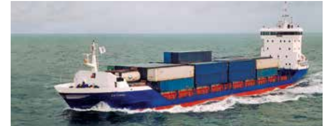
Bermuda Islander Length 99.98 m Capacity 430 TEU