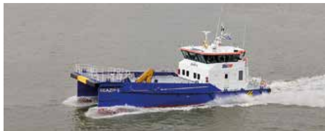
SeaZip 6 Length 26.30 m Passengers 12 Speed 25 kn