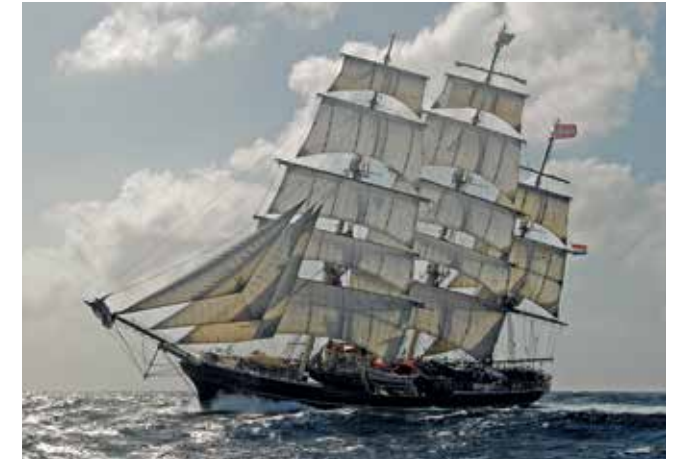
Stad Amsterdam Length 78 m Passengers 18/daytrips 125