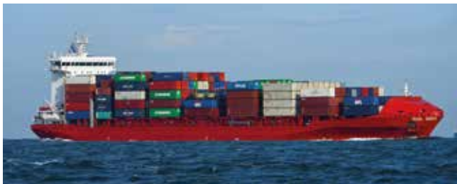
Espoir Length 168.10 m Capacity 1436 TEU