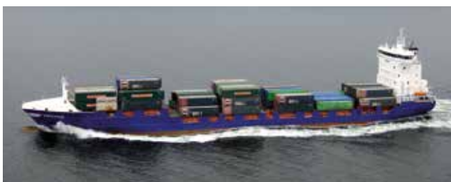
Endeavor Length 134.65 m Capacity 750 TEU