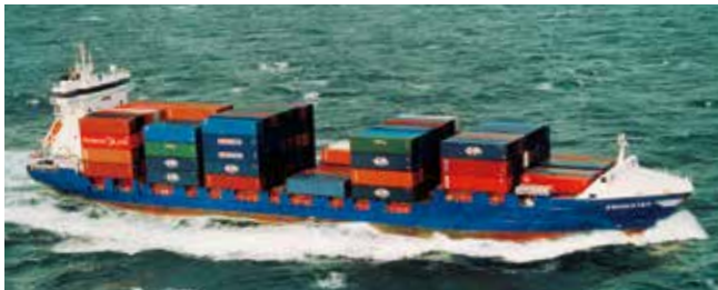
Encounter Length 134.65 m Capacity 750 TEU