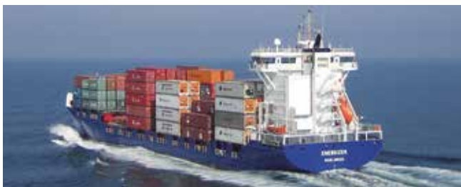
Energizer Length 134.65 m Capacity 750 TEU