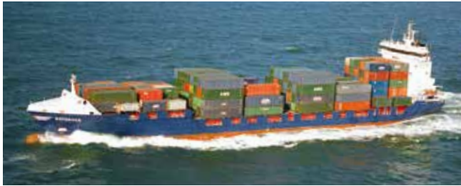
Enforcer Length 134.65 m Capacity 750 TEU