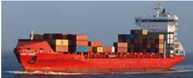
Escape Length 168.10 m Capacity 1436 TEU