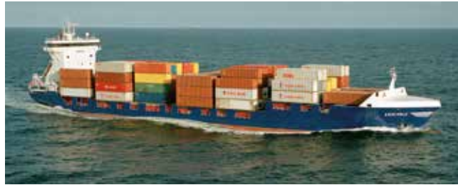
Ensemble Length 134.65 m Capacity 750 TEU