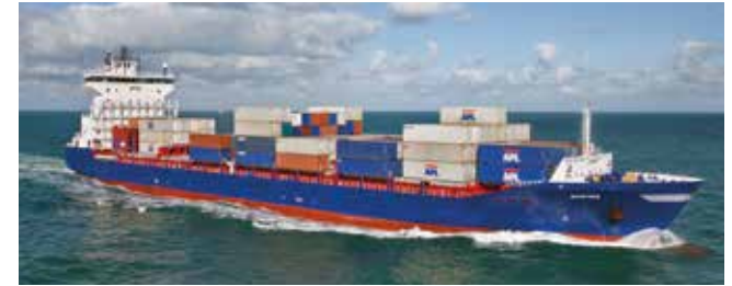
Empire Length 170.15 m Capacity 1440 TEU