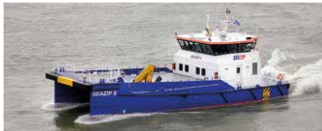
SeaZip 5 Length 26.30 m Passengers 12 Speed 25 kn