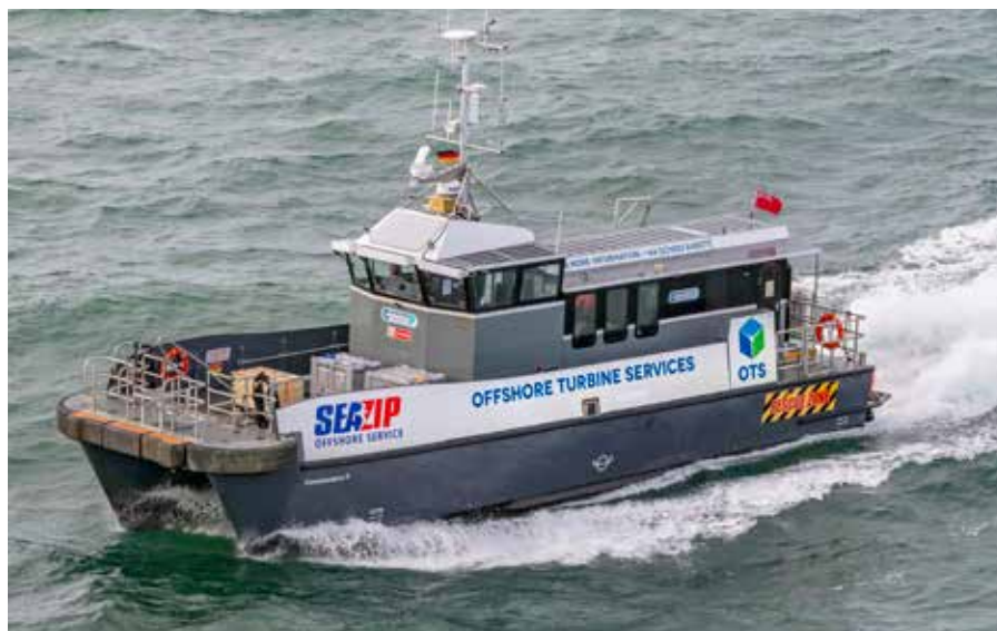
Last year, SeaZip carried out the commercial management of OTS vessels for several projects, including a project close to home: Windpark Fryslân.