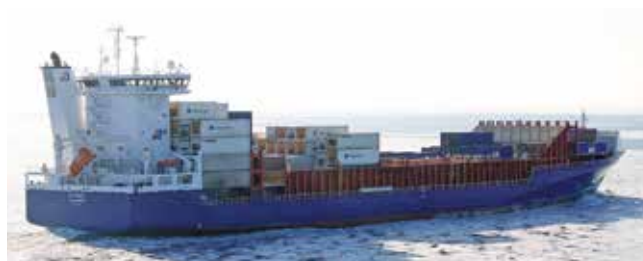
Elysee Length 167.00 m Capacity 1400 TEU