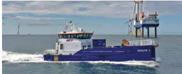
SeaZip 3 Length 26.30 m Passengers 12 Speed 25 kn