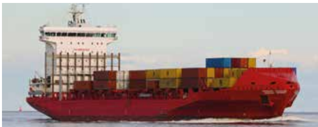
Essence Length 168.10 m Capacity 1436 TEU