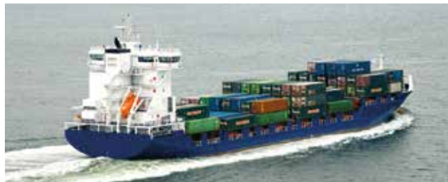
Energy Length 134.65 m Capacity 750 TEU