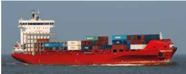
Esperance Length 168.10 m Capacity 1436 TEU