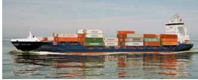
Endurance Length 134.65 m Capacity 750 TEU