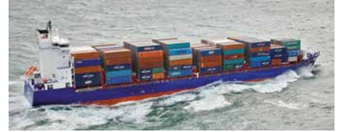
Emotion Length 170.15 m Capacity 1440 TEU